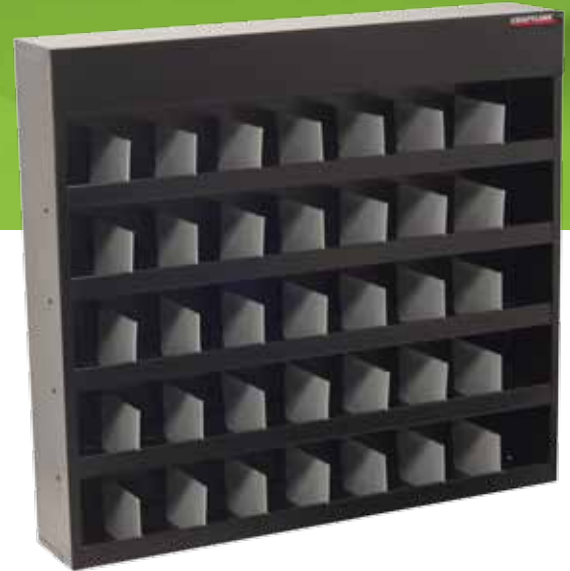
PL-TB-35 25.75" W x 4.5" D x 23" H 40 Bin Adjustable Cabinet

Fully adjustable cabinet featuring "Scoop Front" design, allows individual bin widths to be adjusted in 3" increments. Each row can be divided into as many as 8 compartments for a total of 40 per unit. Included heavy-duty polypropylene dividers fit securely into place to avoid part migration. Patented "Scoop Front" design allows for easy retrieval of small parts. Cabinet can be wall mounted, includes pre-drilled & reinforced eyelet mounting holes in rear. Finished in a durable black textured powder coat.